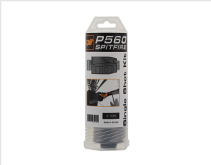
Eurocode 013955 P560 Single Shot Kit