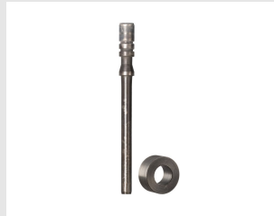
Eurocode 014137 P560 Spare Piston