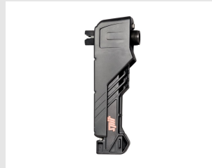
Eurocode 013952 P560 Magazine Kit