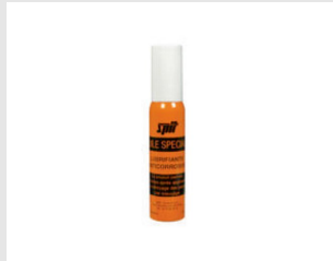
Eurocode 310080 SPIT Lubricating Oil Spray