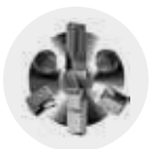
Y-Cutter (SDS-max 18 - 35 mm)