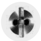
Bionic (SDS-max ≤ 16 mm)

HELLER-TV TUTORIALS www.hellertools.com/en/heller-tv